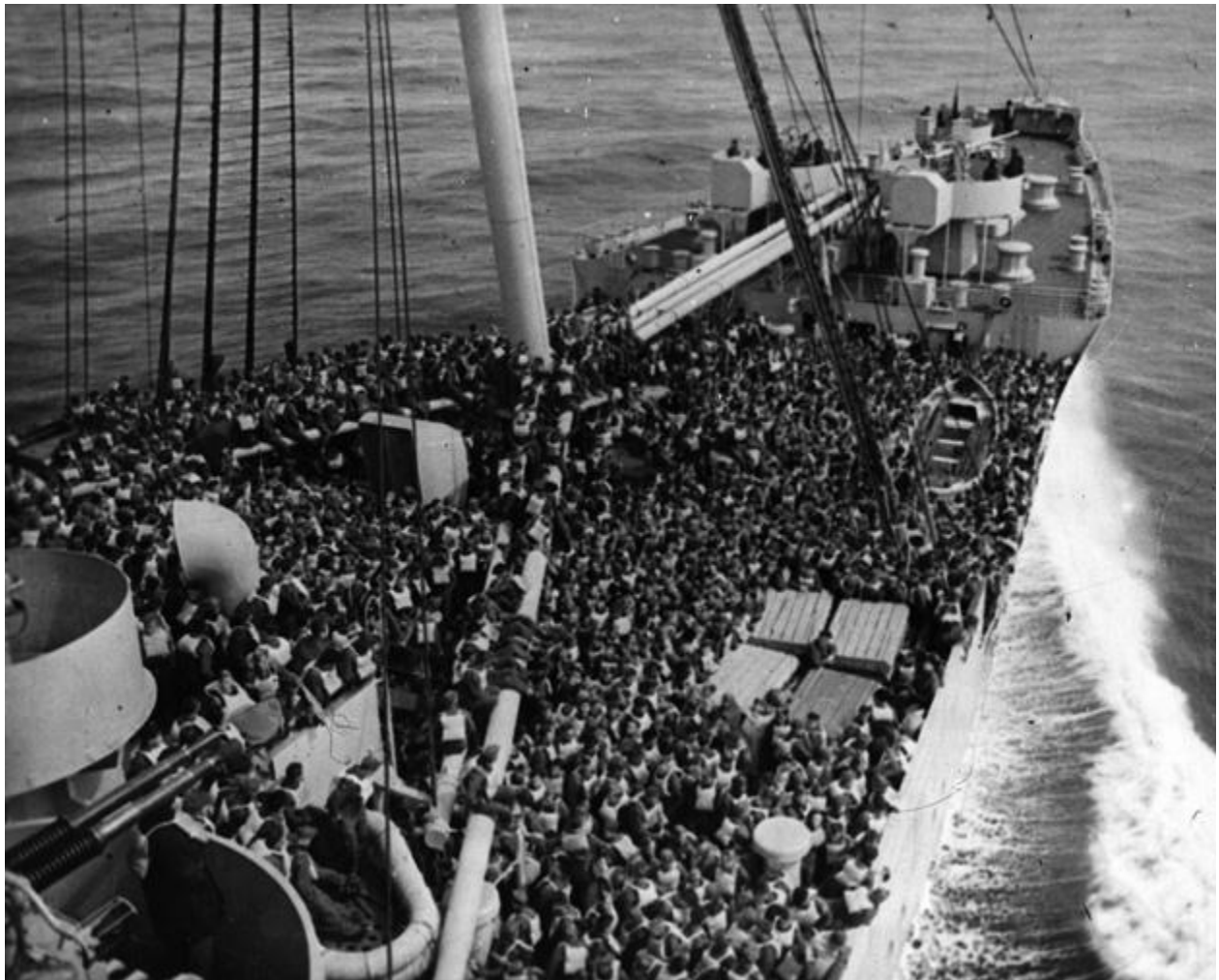
Troops performing a lifeboat drill onboard the Queen Mary in December 1944, before Operation Magic Carpet

Twenty-nine ships were dedicated to transporting war brides: women married to American soldiers during the war.