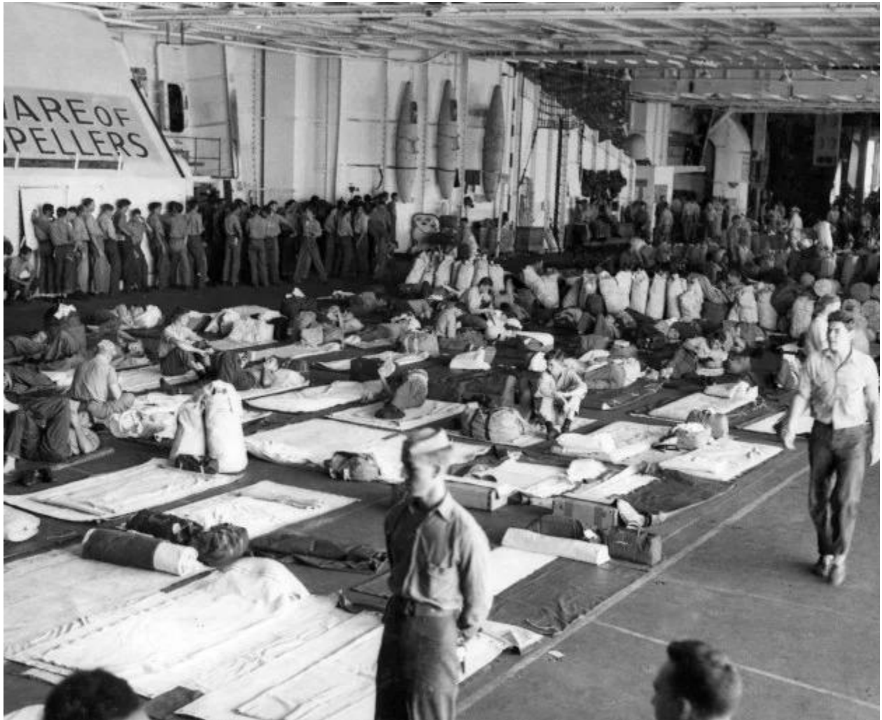
Hangar of the USS Wasp during the operation

Meanwhile, troops going home from Australia or India would sometimes spend months on slower vessels.