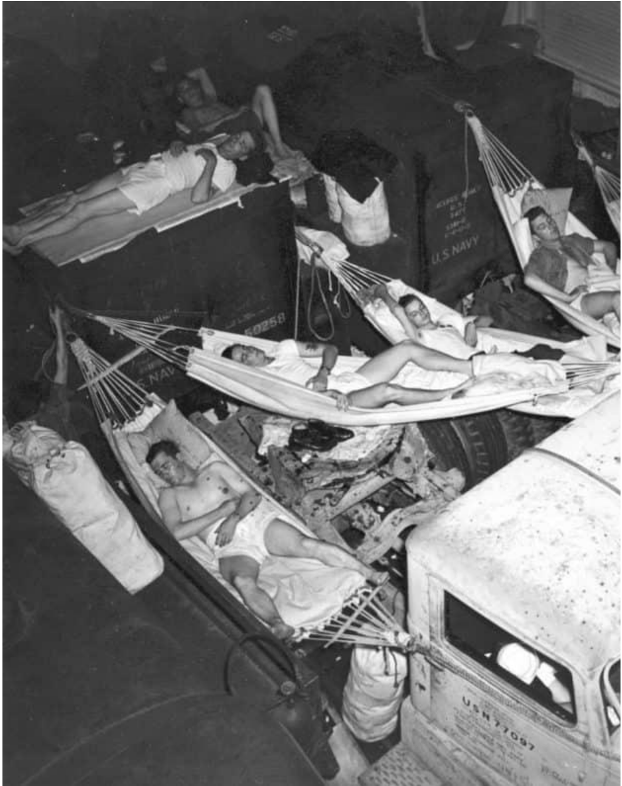
Hammocks crammed into available spaces aboard the USS Intrepid