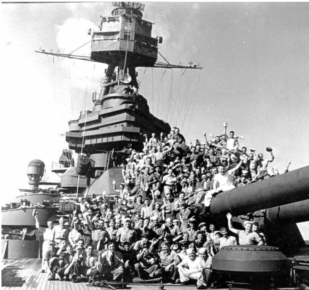
Overjoyed troops returning home on the battleship USS Texas

A Los Angeles taxi driver took six soldiers all the way to Chicago; another took another carload of men to Manhattan, the Bronx, Pittsburgh, Long Island, Buffalo and New Hampshire. Neither of the drivers accepted a fare beyond the cost of gas.