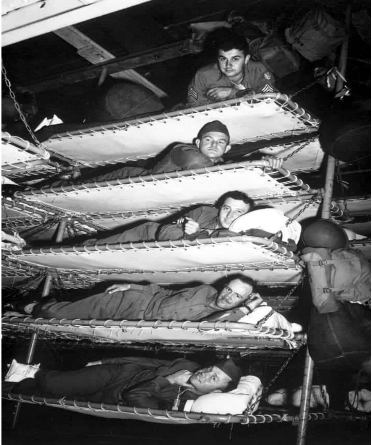
Bunks aboard the Army transport SS Pennant

The Navy wasn't picky, though: cruisers, battleships, hospital ships, even LST's